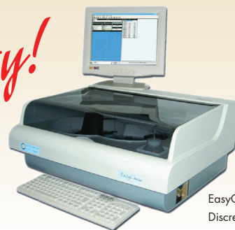
EasyChem Discrete Analyzer